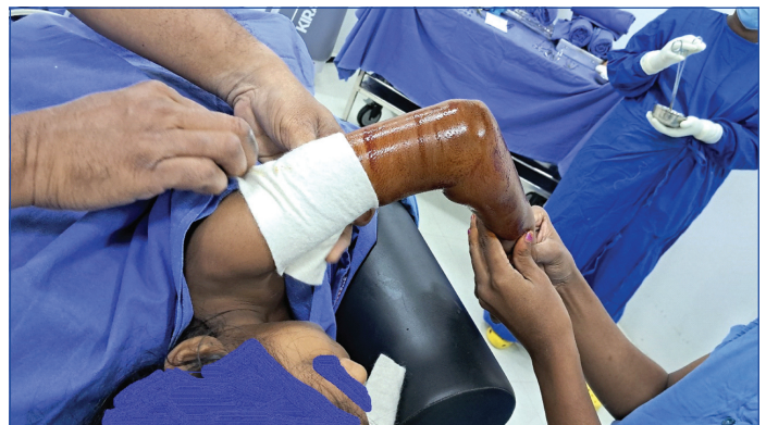
[Table/Fig-2]: Well sedated patient without any gas administration and initiation of surgical procedure.

in considerable pain relief. This method not only offered enough pain relief, but also allowed the child to fall asleep [Table/Fig-2], which contributed to the ease of the surgical procedure.